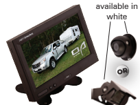
OA7MCS 2 Way Reverse Camera System