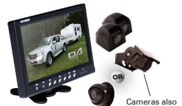
OA485CS 4 Way Reverse Camera System