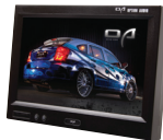
OA70HR 7" LCD Monitor

(Your reverse camera can be paired with any Option Audio Screen Source)