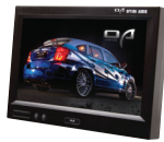
OA70HR 7" LCD Monitor

(Your reverse camera can be paired with any Option Audio Screen Source)