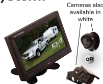
OA7MCS 2 Way Reverse Camera System