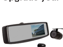
OA43RMPK 4.3" Screen • Bluetooth • Camera