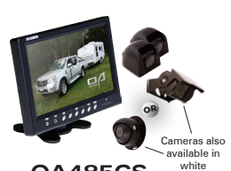
OA485CS 4 Way Reverse Camera System