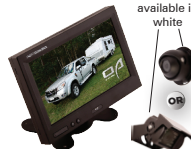
OA7MCS 2 Way Reverse Camera System