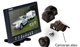
OA485CS 4 Way Reverse Camera System