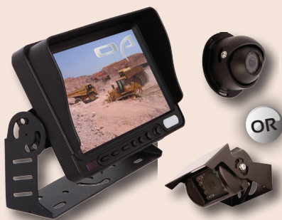
1 x Rear Mount Camera

◀OA7C 2-Way Reverse Camera System (Industrial/ Commercial)