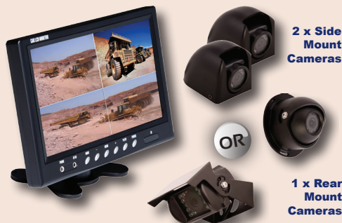
2 x Side Mount Cameras